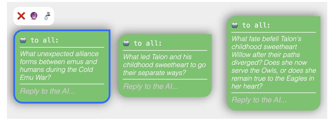
Figure 2: Several AI-generated questions from a Patchwork storyworld about the "Cold Emu War". Questions are formatted like text messages from the AI, and can be repositioned on the canvas or deleted like any other scrap. They can also be answered via an open-ended text field, or "reversed" (triggering the AI to provide one or more answers to the question itself) via controls that appear above a selected question scrap (like the one on the left).